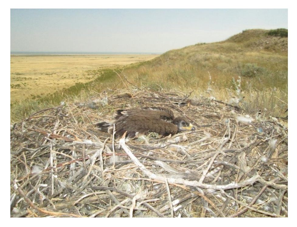
Figure 10 -Nest of the steppe eagle (Aquila nipalensis) on the top of Sasay mountain