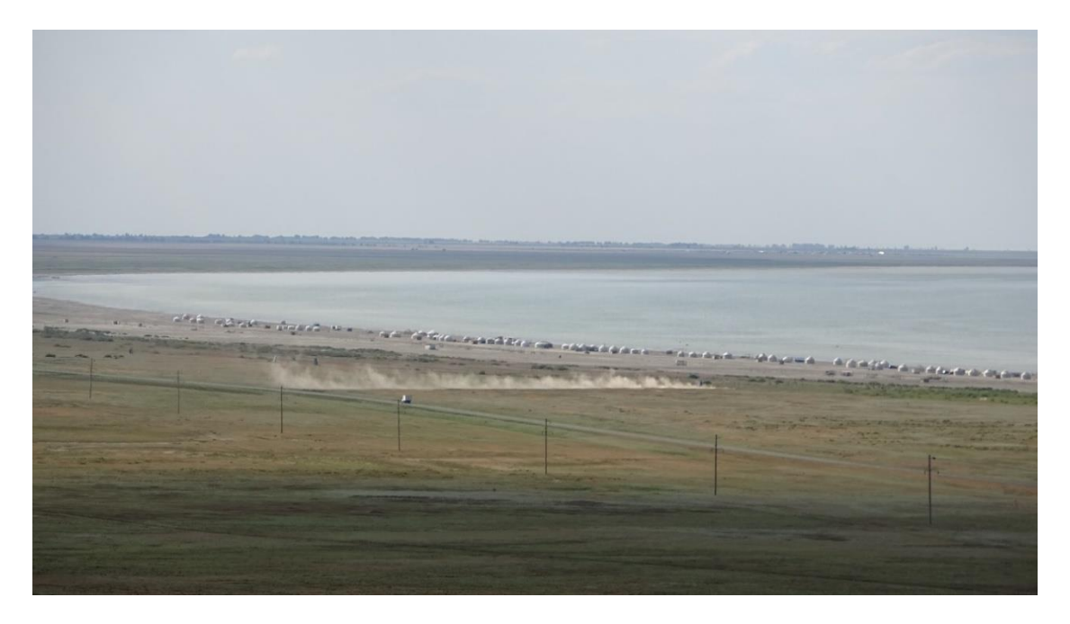
Figure 12 - A strip of recreational and tourist infrastructure of light Assembly and disassembly type along the southern shore of lake Shalkar