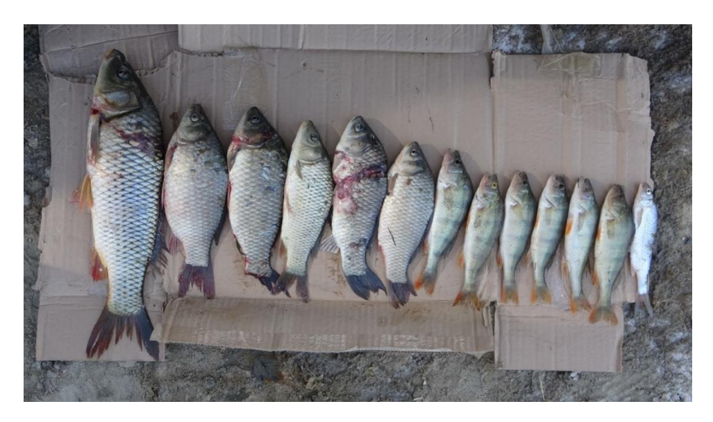
Figure 8 - Some representatives of the ichthyofauna of lake Shalkar in the control catches of 2019(from left to right: carp, Carasiusgibelio (Bloch, 1782), perch, Percafluviatilis (L., 1758), rudd, Scardiniuserythrophtalmus (L., 1758)

The ichthyofauna of lake Shalkar in 2019 is represented by 7 species of freshwater and commercial fish: perch, crucian, carp, roach, pike, rudd, ide. (Fig. 8), i.e., in comparison with 2006 (10 species), the diversity has decreased by three species.