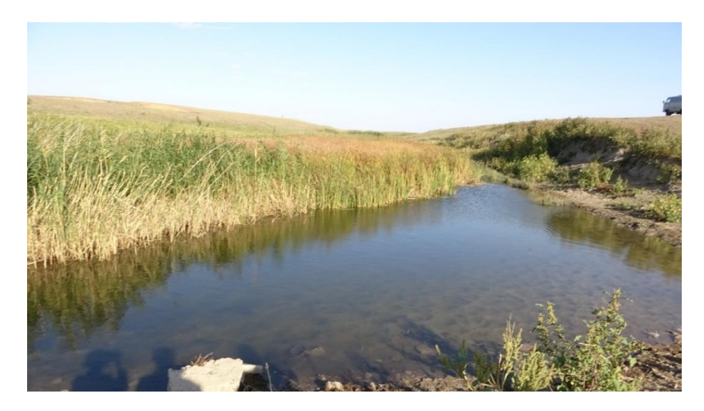
Figure 4 - Upper course of the EsenAnkaty river near the settlement of Segizui

On the rivers YesenAnkaty and SholakAnkaty from coastal water plants we have registered hygrophytes: sedge Ranya Carex praecox Schreb., lake reeds Schoenoplectuslacustris L., marsh Eleocharispalustris (L.), bulrushs Juncusacutus L. and Gerard J. gerardii Loisel. Hydrophytes are represented by small duckweed Lemna minor , water lily Nymphaea candida , cupola Nupharlutea L., hornwort Ceratop hyllumdemersum L. at the edge of the left Bank of the river, thickets of southern reeds ( Phragmitesaustralis (Cav.) Trin. ex Steud.). The local population uses this section of the Yesen Ankaty river for watering farm animals (Fig. 4).