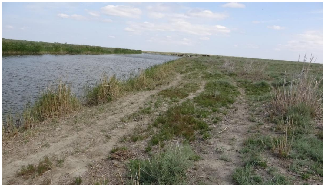
Figure 6 -Bank in the lower reaches of the EsenAnkaty river near the village of Chelkar

Here the thickets of southern reeds ( Phragmitesaustralis (Cav.) Trin. ex Steud.), lake reeds ( Schoenoplectus lacustris (L.) Pallas (1888)) and narrow-leaved cattails ( Typhaangustifolia L., 1753) (Fig.6). The local population is driven to the banks of domestic animals, there are traces of harvesting reeds. Significant areas of halophiles represented by the monotypic kermek formation Limonium ( Limonium gmelinii (Willd.) Kuntz., L. caspium Willd., L. suffruticosum (L.) Kuntze , L. sareptanum (L.) Hams.), which is evidence of the high salinity of the YesenAnkata river Bank, which leads to the loss of valuable meadow plant species from the herbage. Vegetation on the shores of lake Shalkar and in the mountains of Santas and Sasay is degraded by overgrazing of farm animals (Fig. 7).