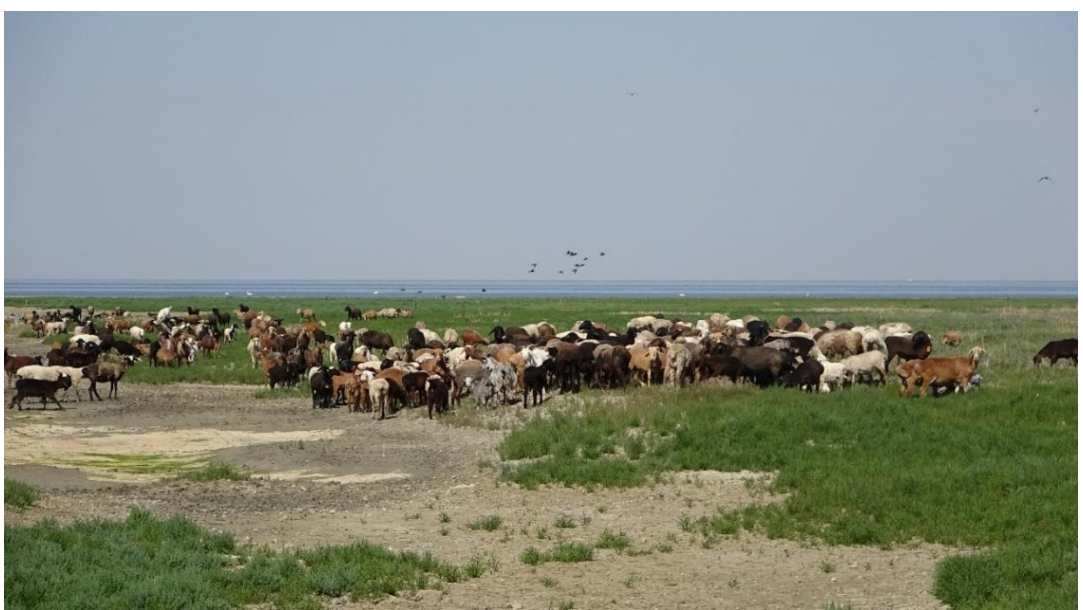
Figure 7 - Grazing sheep and goats near the village of Chelkar, located East of lake Shalkar

The high salinity of the coastal territory of the lake with huge expanses of open area of the coasts, from which sand and salt suspensions are carried by the wind, allow monogroups of halophytic and weed vegetation to capture land plots every year.