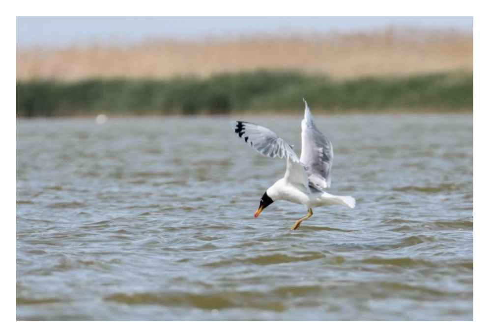
Figure 11 -Black-Headed chuckler, Ichthyaetusichthyaetus (Pallas, 1773)