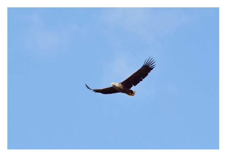
Figure 9 - White-tailed Eagle, Haliaeetusalbicilla

In the southern coastal part of lake Shalkar, there is an increase in recreational load, there are objects for recreational and tourist purposes of capital and light Assembly and disassembly type (Fig.12). The infrastructure area for swimming and recreation along the shore of lake Shalkar is about 5 km away. During the summer, lake Shalkar is visited by about 20 thousand tourists. Infrastructure of light Assembly and disassembly type is not connected to power lines, which is due to their absence in the coastal recreation area of the reservoir. There is a lack of public toilets, and there are no special places for Parking tourist's vehicles. Vacationers do not fully comply with basic environmental rules and requirements, which leads to the littering of the coastal zone of lake Shalkar with solid household waste and contamination of the soil and vegetation cover with sewage and car exhaust gases. All this leads to an increase in anthropogenic influence on lake Shalkar (Fig.13).