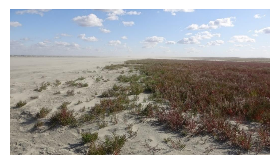
Figure 2 -Shoreline of the lake with Salicornia perennans salt marsh

Along the entire shoreline of lake Shalkar on the southern side grow thickets of Salicornia perennans Willd., with the transition to the kokpekovo-kermekovo community with a comb, remaining under the moving Sands and silt (Fig. 2,3). Until autumn, this vegetation remains intact, and in winter it is satisfactorily eaten by sheep and goats. Under the soleros groupings, ground water lies at a depth of 20 cm and contains up to 30 g of salts per 1 l, with a predominance of chlorides.