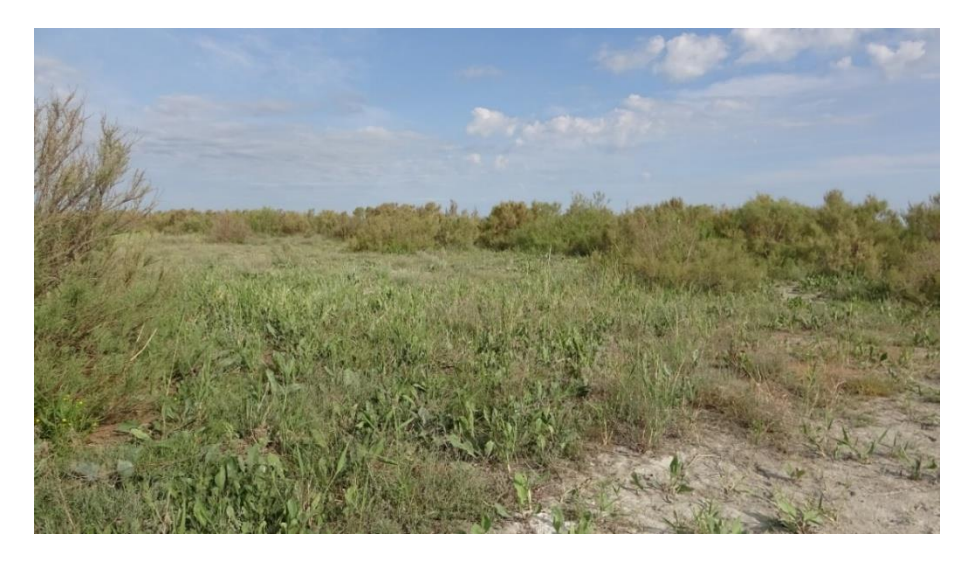
Figure 3 -Thickets of tamarisk in the southern part of lake Shalkar