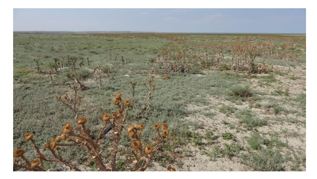
Figure 5 -Thickets of prickly Onopordumacanthium L. on the Bank of the river Yesen Ankaty

In the grasslands of the lake coasts and the Yesen Ankaty and Sholak Ankaty rivers that flow into the lake, along with the increased pasture impact, there is a high infestation of these territories with prickly ( Onopor dumacanthium L.), sometimes they occupy a significant area, displacing native species, often forming monotypic structures of vegetation cover (Fig.5).